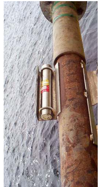
Mounting of WiSens-DA on a corer

* Binary data format for high sampling rate